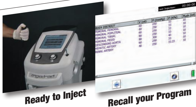
Ready to Inject