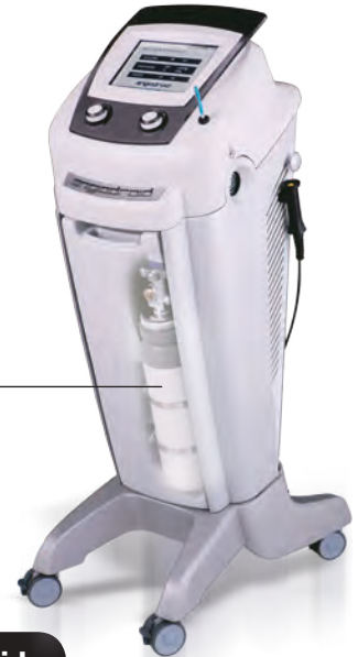
CO 2 Cylinder inside